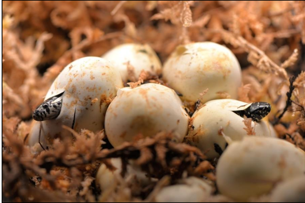
Above: These hatchling kingsnakes were pit tagged and released in August.