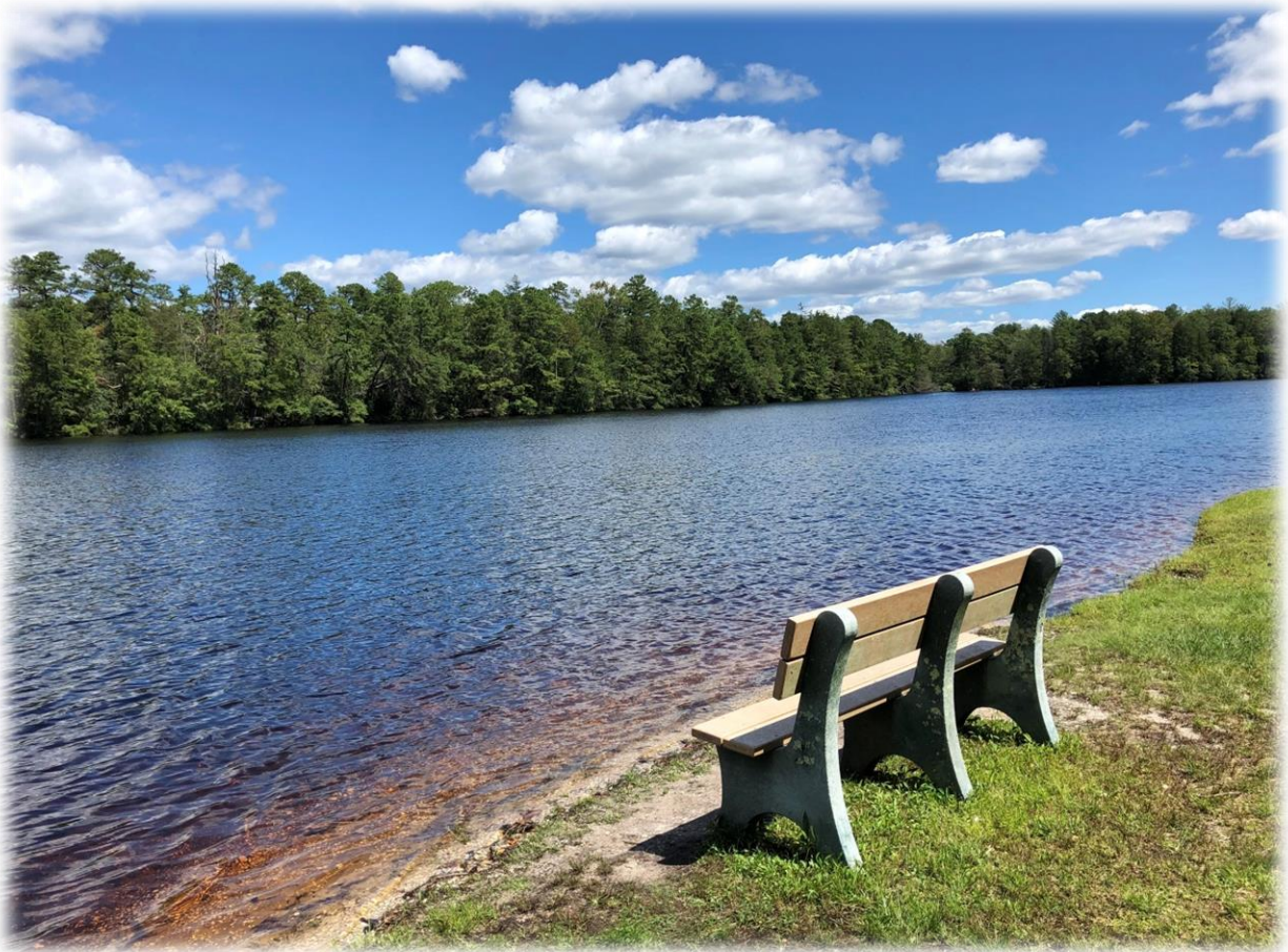
Lake Nummy in Belleplain State Forest in Cape May and Cumberland counties