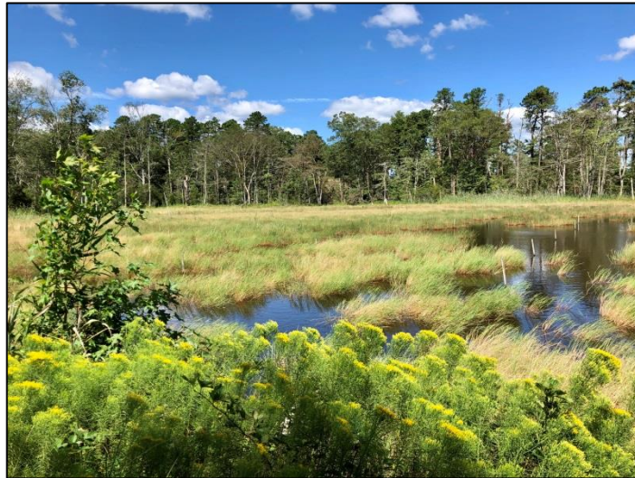
Above: In August 2020, staff posted 105 photographs on the Commission’s Facebook page, including this one at the Tuckahoe Wildlife Management Area in Atlantic and Cape May counties.