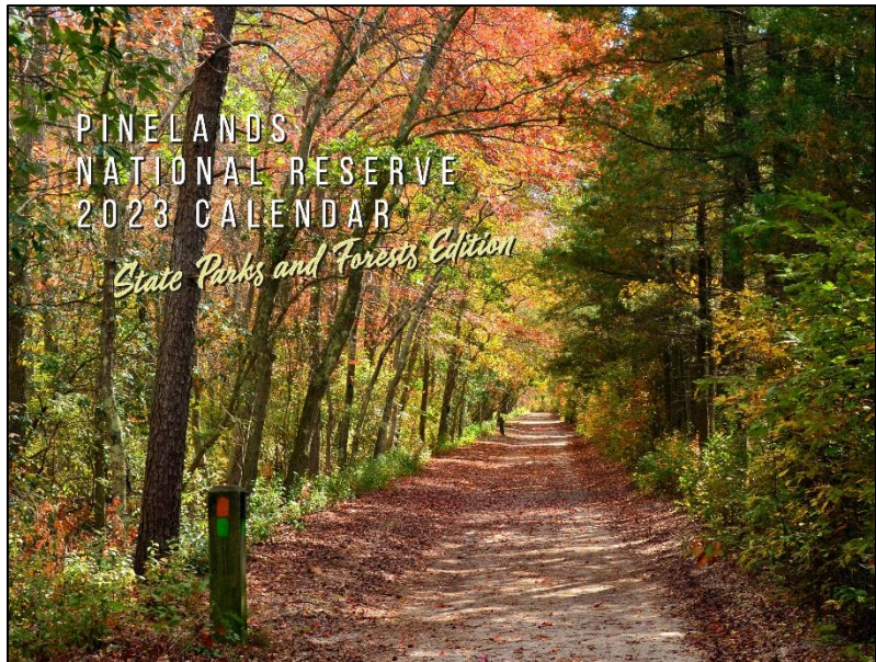
Above: The front cover of the 2023 Pinelands National Reserve wall calendar features a photo of a hiking trail at Double Trouble State Park in the Pinelands.