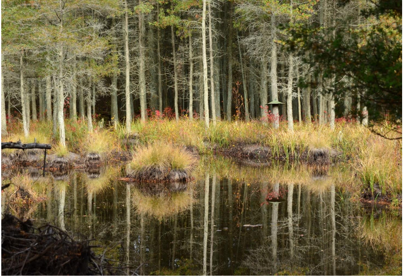
A reflection of vegetation in a swamp in Brendan T. Byrne Forest in the Pinelands in November