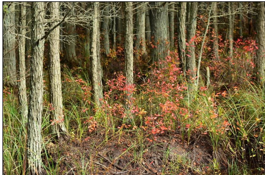
Above: The Commission shared 71 photos on Instagram in November, including this photo of fall foliage at Brendan T. Byrne State Forest.