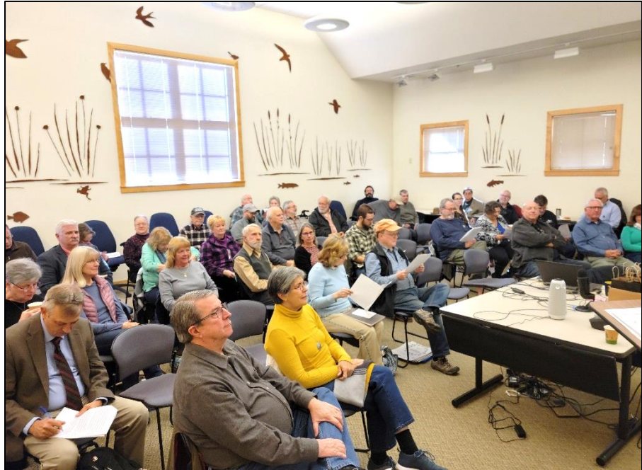
Above: Approximately 60 people attended the Commission’s Archaeology and Anthropology Symposium on November 18, 2022.

The event was livestreamed, recorded and is available for viewing on the Commission’s YouTube Channel.