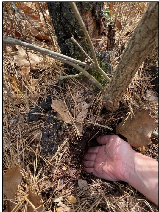
Above: Here is a hole left by a box turtle after it emerged from hibernation in the spring.