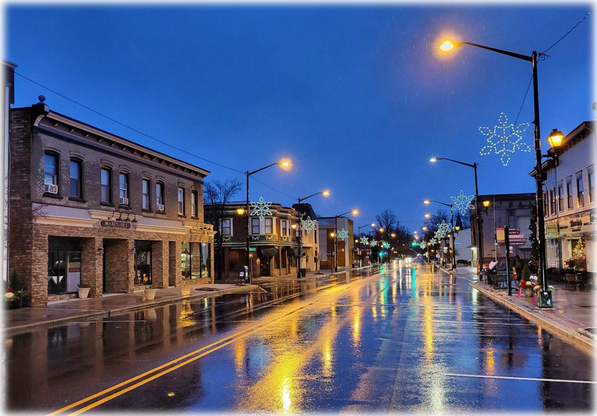
A rainy December morning in downtown Hammonton in the New Jersey Pinelands