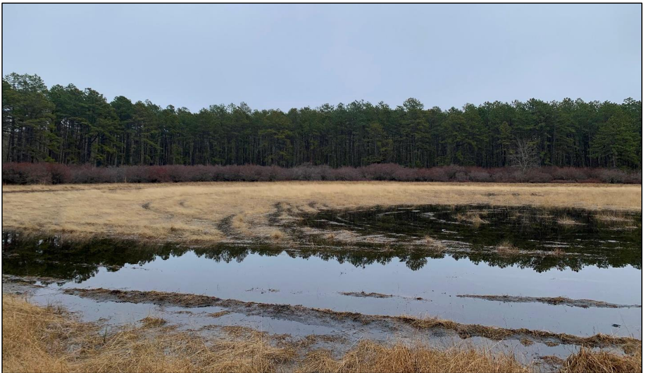
Above: Since 2005, Commission scientists have monitored the pond water level in this large natural coastal-plain pond as part of the National Park Service funded Environmental Monitoring Program. Over the years, vehicles have repeatedly breached the tall shrub border and driven through the pond, churning up the soft, organic sediments and damaging the plant community. This image shows vehicle damage that occurred between November and December 2023.