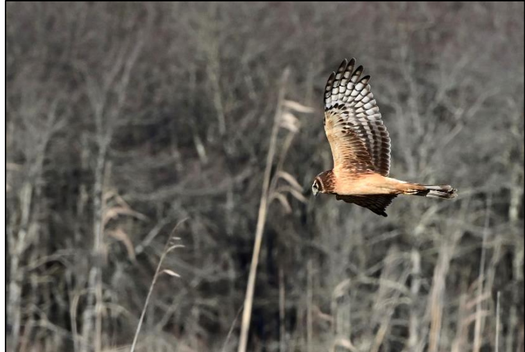
Above: Commission staff shared a total of 80 photos on the agency’s Instagram site in December, including this photo of a female northern harrier foraging in the Pinelands.