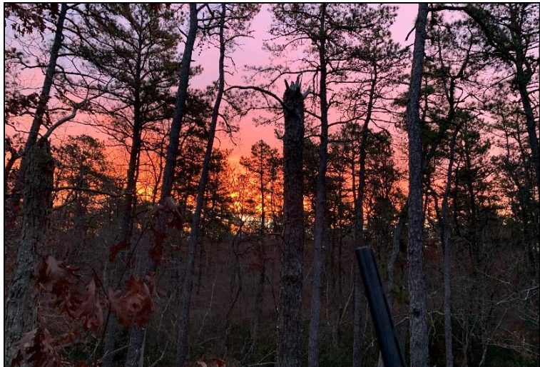
Above: Commission staff shared 27 tweets on X (formerly Twitter) in December, including this photo of sunrise in Bass River State Forest in the Pinelands.