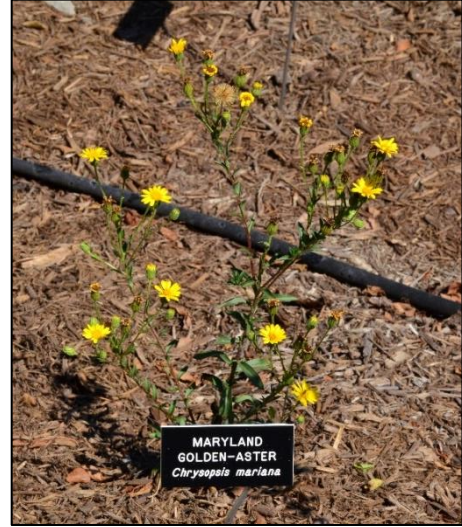
Above: Staff purchased and have installed plant identification markers in the Commission’s rain garden.