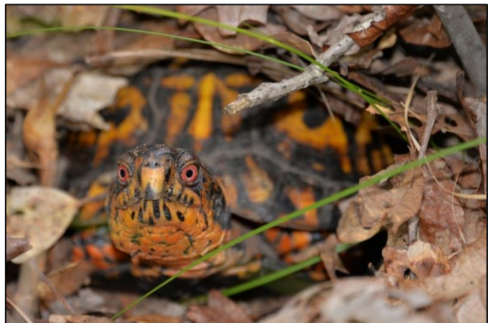
Above: A new radio tracked male box turtle captured a few days ago.