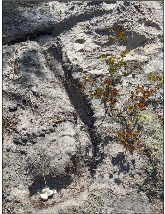
Above: A pine snake nest excavated as part of the Rare Snake Monitoring Project. Female pine snakes dig a long tunnel and deposit their eggs in an underground cavity.