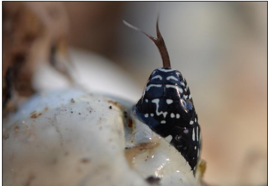
Above: An eastern king snake hatchling “tasting” fresh air for the first time.

Science staff have initiated the process of applying to the Environmental Protection Agency for additional funding to help complete the King Snake Study. It is possible that some funding may be available at the start of the next federal fiscal year in October.