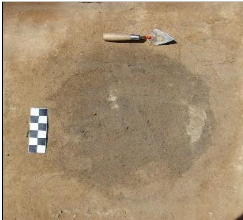
Above: Buried remains of a structural feature containing charcoal flecking and small brick fragments.