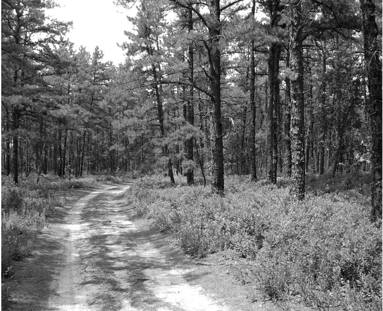
A sand road winds its way through a typical Pinelands pitch pine upland forest in Shamong Township, Burlington County.