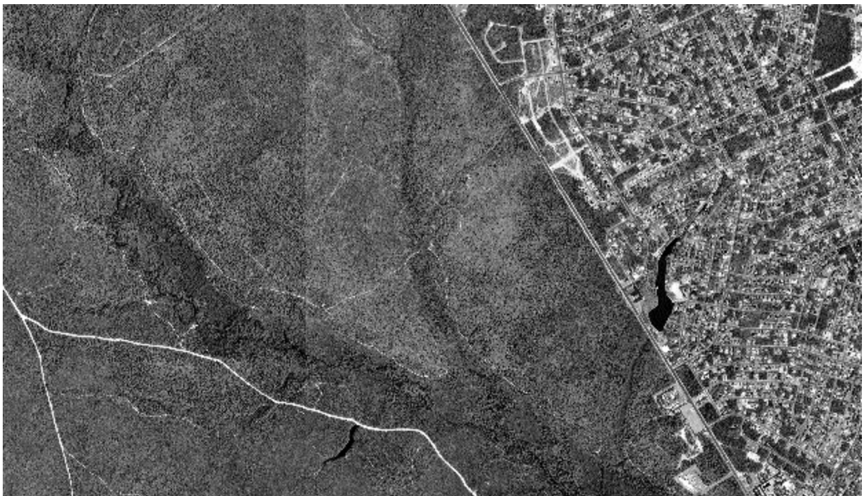
Nine Pinelands Management Area designations regulate the types and intensities of development that are permitted throughout the Pinelands. This aerial photograph shows the contrast between a Pinelands Forest Management Area (left) and Pinelands Regional Growth Area (right) in Stafford Township, Ocean County (divided by Route 72). The photo illustrates how effective Pinelands zoning has been at directing growth. Note the vivid sand trails through the forest. The darker-shaded forest areas are Atlantic White Cedar swamps along the Manahawkin Mill Creek.

Using the input provided from a visioning process to take place during 2003, the consultants will lead community design "charrettes" to rough out concepts and physical plans for future development, which will be used to develop a long-range strategic vision. This vision will guide the preparation of community action plans for both towns, focusing on specific products and recommendations in the areas of zoning, subdivision, and site plans; architectural design; and transportation, infrastructure, and community facilities (including open space). The action plans will include implementation strategies with information on responsibilities and support for implementation. At the conclusion of the project, results will be shared with the broader community through a series of educational seminars at the Commission's Richard J. Sullivan Center.