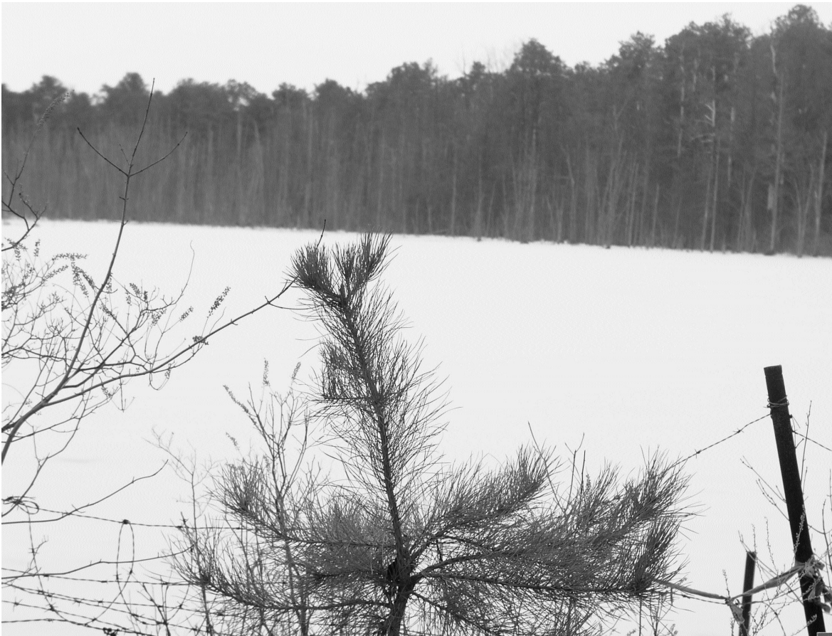
Front Cover: North Branch of Forked River, Lacey Township, Ocean County. Above: Frozen, snow-covered lake on border of Buena Vista Township, Atlantic County and Franklin Township, Gloucester County.

The mission of the New Jersey Pinelands Commission is to preserve, protect and enhance the natural and cultural resources of the Pinelands National Reserve, and to encourage compatible economic and other human activities consistent with that purpose.