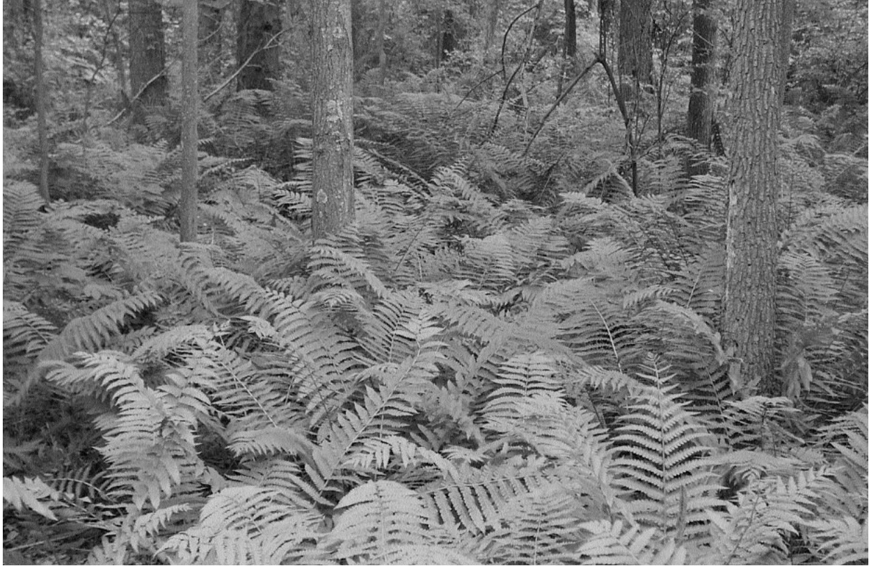
A blanket of cinnamon fern ( Osmunda cinnamomea ) dominates the understory of a hardwood swamp near the North Branch of the Rancocas Creek in Pemberton Township, Burlington County. In 2002, Commission Scientists completed a comprehensive assessment of aquatic and wetland resources in Pinelands portions of the Rancocas Creek Basin.