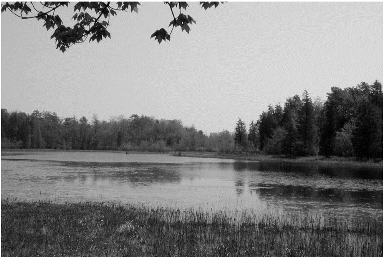
The Pinelands Commission worked with The Nature Conservancy (TNC) of New Jersey in 2002 to permanently protect 382 Pinelands acres, including expanding TNC's Hirst Ponds Preserve (above) in Galloway Township, Atlantic County. Hirst Ponds is a system of Pinelands vernal ponds which provide habitat for Pine Barrens treefrogs ( Hyla andersonii ) as well as the rare Hirsts' panic grass ( Panicum hirstii ), first collected at this location in 1959 by Frank and Robert Hirst.

In late 2002, the Pinelands Commission and TNC initiated a $400,000 land acquisition grant program for local and county governments and non-profit organizations, also funded by the CMCMUA agreement. In addition, the Commission and TNC were finalizing the terms of a new acquisition of some 500 acres in Burlington County.