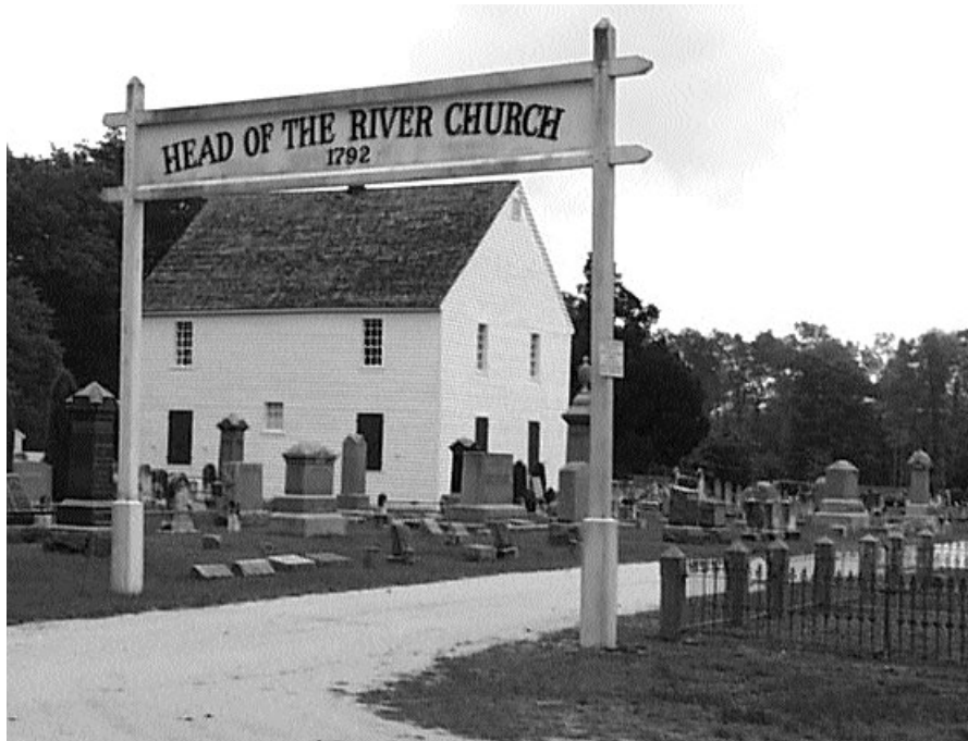
The Pinelands Commission is working with 16 municipalities to create a Scenic Byway that will highlight some of the scenic natural and cultural resources of the lower Mullica River Basin and Delaware Bayshore portions of the Pinelands. The historic village of Head of the River, above, which straddles Estell Manor, Atlantic County and Upper Township, Cape May County is included along the route.

In May of 2002, a temporary organizing committee was formed, comprising six municipal representatives. The organizing committee will review any proposed amendments to the route and drafts of byway nomination materials until such time as a permanent management committee of municipal representatives is appointed to administer the byway over the long term. Also during 2002, the Pinelands Commission began soliciting official support from the municipal and county governments along the route. At year's end, ten municipalities and two counties had passed resolutions supporting the byway. Once all of the resolutions are adopted, work will begin on an inventory of natural and cultural resources along the byway.