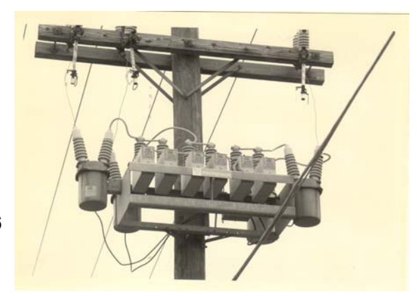
Figure 4-3. Six large high voltage capacitors.