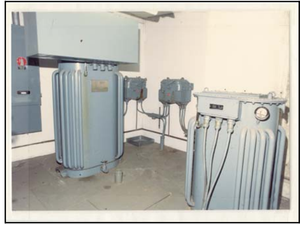
Figure 4-1. Two PCB Transformers.

PCBs are chlorinated fire-resistant fluids that meet the definition established in the National Electrical Code (NEC) for askarel, the generic name for non-flammable synthetic chlorinated hydro-carbons used for insulating media. Askarel transformers, containing 40 to 60