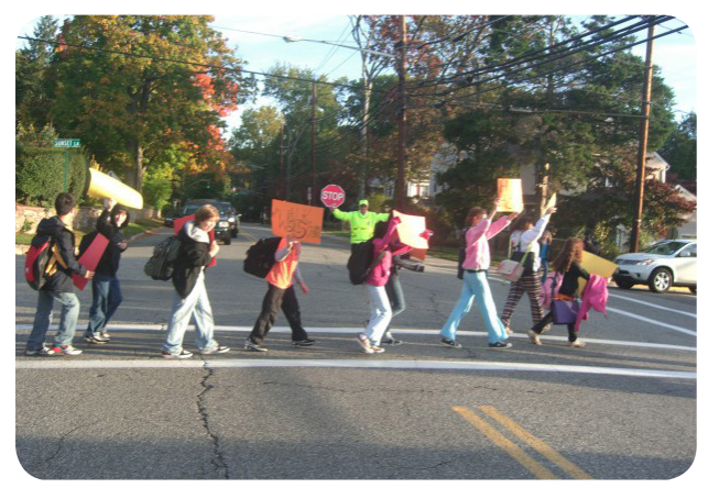
Walk to School Event in Tenafly, NJ.