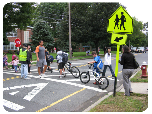
Students crossing in Ridgewood, NJ.

The goals of the SRTS Program are to encourage more students to walk and bike to school where it is safe to do so and to improve the areas where it is not safe.