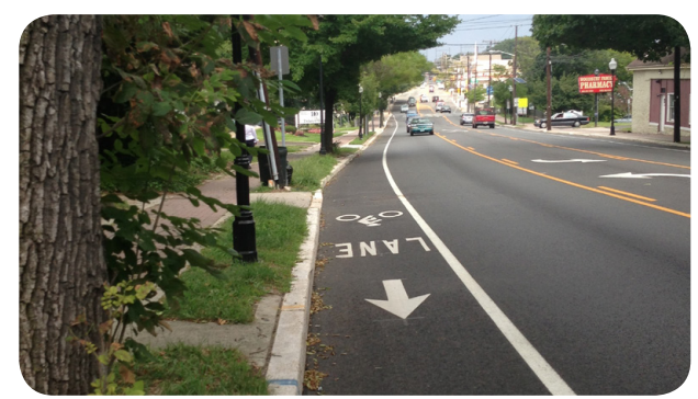
A bike lane along Route 45 in Woodbury, NJ.

When to Use/Typical Application: Bike lanes are most helpful on streets with \geq 3,000 motor vehicle average daily traffic, a posted speed \geq 25 mph, or high transit vehicle volume; they should typically be provided on both sides of two-way streets to prevent wrong-way riding; the preferred width for young cyclists is 5 feet.