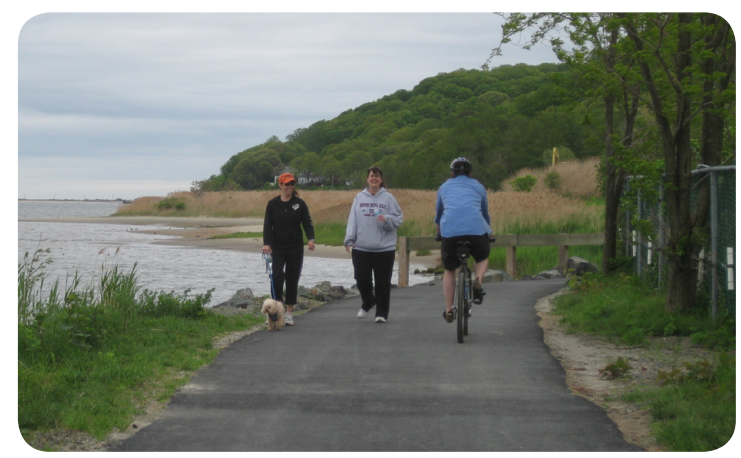
The Henry Hudson Trail in Monmouth County, NJ is an example of a shared use path.

Drawbacks: Rarely the most direct means of transportation; shared use paths attract a variety of user groups who often have conflicting needs. When to Use/Typical Application: 10 feet is the recommended minimum width for a two-way, shared use path on a separate right-of-way; 2 feet of graded area should be maintained adjacent to both sides of the path and 3 feet of clear distance should be maintained between the edge of the trail and lateral obstructions; shared use paths fall under the accessibility requirements of the Americans with Disabilities Act (ADA).