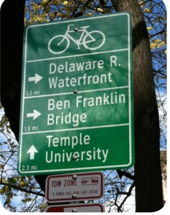
Bike route signs in Philadelphia show distance to destination.

When to Use/Typical Application: Signs are typically placed at decision points along bike routes – typically at the intersection of two or more bikeways and at other key locations leading to and along bicycle routes; signs should be oriented so bicyclists have sufficient time to comprehend the sign and change their course, when needed.