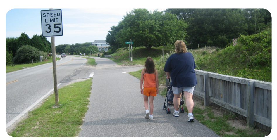
Example of a sidepath.

When to Use/Typical Application: Where right-of-way or other physical constraints prohibit path alignment in independent rights-of-way and there are no practical alternatives for improving the roadway or accommodating bicyclists on nearby parallel streets; when the sidepath can be built with few street and/or driveway crossings; when the adjacent roadway has relatively high-volume and high-speed traffic; the minimum recommended distance between a path and the roadway curb is 5 feet. When the separation is less than 5 feet, a physical barrier or railing should be provided; utilizing or providing a sidewalk as a shared use path is undesirable.