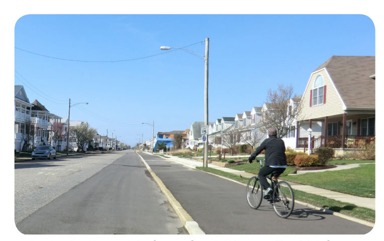
A raised cycle track in Ocean City, NJ.