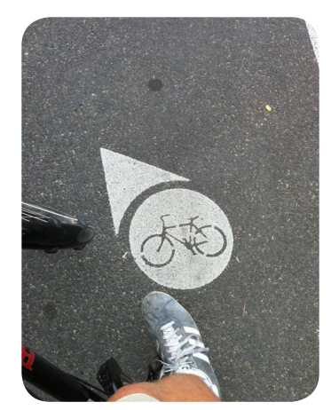
Bike Dots are pavement markings for signed bicycle routes. They are a tool to provide wayfinding.