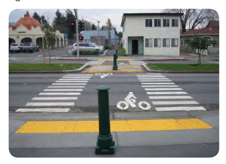
A crossbike in Berkeley, CA.

Drawbacks: Crossbike markings will have higher than normal wear based on the level of crossing auto traffic. When to Use/Typical Application: Where main bicycle routes cross relatively minor collectors; where cross traffic has to yield right-of-way to crossing bicyclists; not appropriate where speeds exceed 30 mph unless signalized.