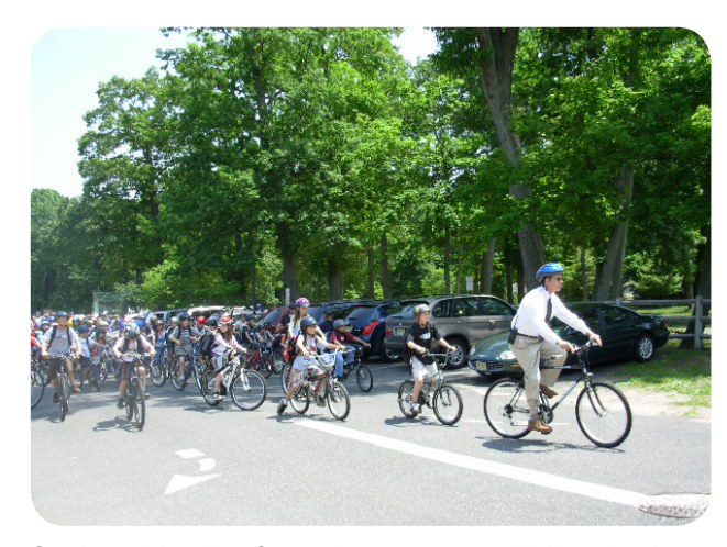
Students bicycling from elementary to middle school on "Transition Day" in Fair Haven, NJ.