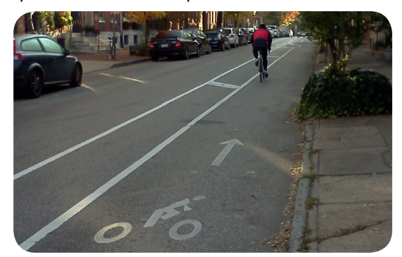
A buffered bike lane in Philadelphia, PA.

When to Use/Typical Application: Buffered bike lanes should be considered on streets with high traffic volume, regular truck traffic, high parking turnover and a speed limit > 35 mph.