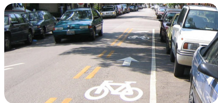
A contra-flow bicycle lane in Chicago, IL.

When to Use/Typical Application: Where it would provide substantial savings in out-of-direction travel and/or direct access to high-use destinations; where there will be fewer conflicts when compared to a route on other streets; when there are few intersecting driveways, alleys, or streets on the side of the street with the contra-flow lane; where bicyclists can effectively and conveniently make transitions at the termini of the lane.