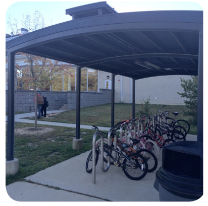
Covered bicycle parking at Egg Harbor's Spragg Elementary School.