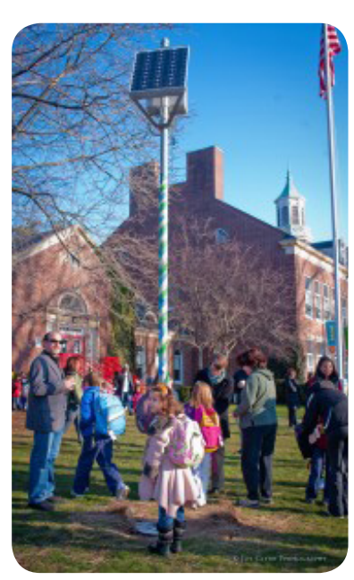
The "zap" machine tracks participants as they arrive at Montclair's Edgemont School as part of the Boltage Program.