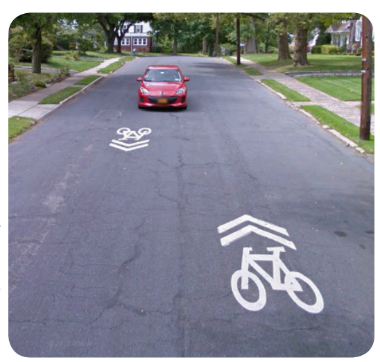
Sharrows on a residential street in Maplewood, NJ.

When to Use/Typical Application: When there is insufficient width to provide bike lanes; on a steep downgrade; shared lane markings are not a preferred treatment on streets with posted 35 mph speeds or faster and motor vehicle volumes higher than 3,000 AADT; sharrows shall not be used on shoulders or in designated bicycle lanes; they should be placed immediately after an intersection and spaced at intervals not greater than 250 feet thereafter.