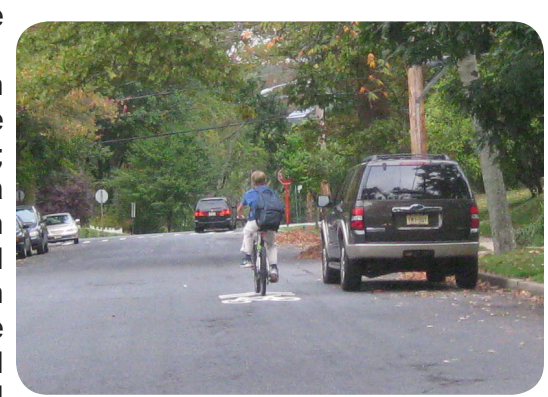
A student riding a bicycle over a sharrow in Maplewood, NJ.