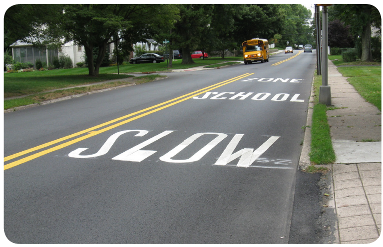
SLOW SCHOOL ZONE pavement marking in Ridgewood, NJ.

Benefits: Low cost and easy to install. Can increase motorist awareness of pedestrians and bicyclists. Drawbacks: Requires regular maintenance. Not visible with snow-covered roads. Costs: Low