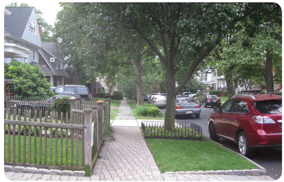
Landscaped buffer in Jersey City, NJ.

Costs: Moderate to high - varies depending on scale and materials/ plantings