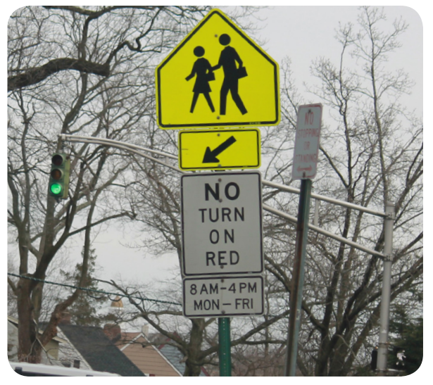
Turning right on red is restricted during school hours at this intersection.