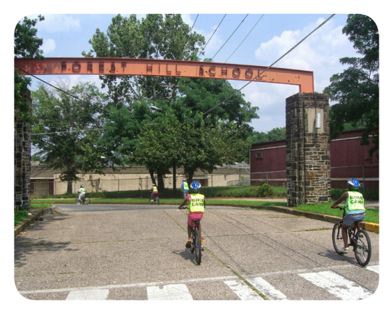
Gateway to Forest Hill School in Camden, NJ.

Benefits: Can be visually aesthetic and heighten awareness. Creates a unique image for an area. Drawbacks: Can require routine maintenance. Costs: Varies