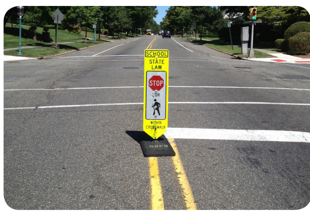
In-Street Stop for Pedestrians Sign with SCHOOL plaque mounted above the sign in Glen Ridge, NJ.

Costs: Varies, depending on type and amount of signage.