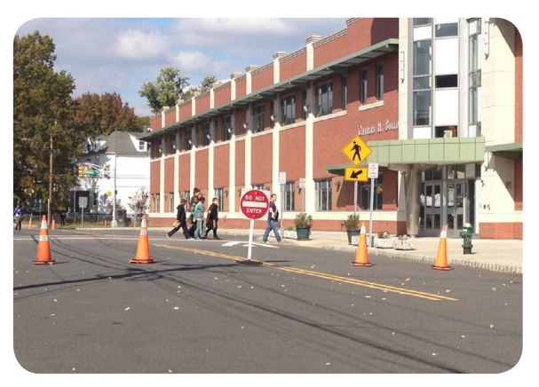
Temporary roadway closure in front of the Bullock School in Montclair, NJ.

Drawbacks: This treatment may create traffic problems on other streets. Costs: Low