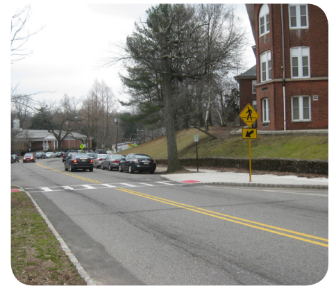
Curb extension in front of the middle school in Maplewood, NJ.

Costs: High ($30,000 - $100,000), varies depending on materials, landscaping