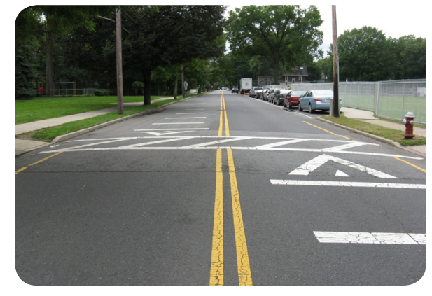
Raised crosswalk at Somerville School in Ridgewood, NJ.