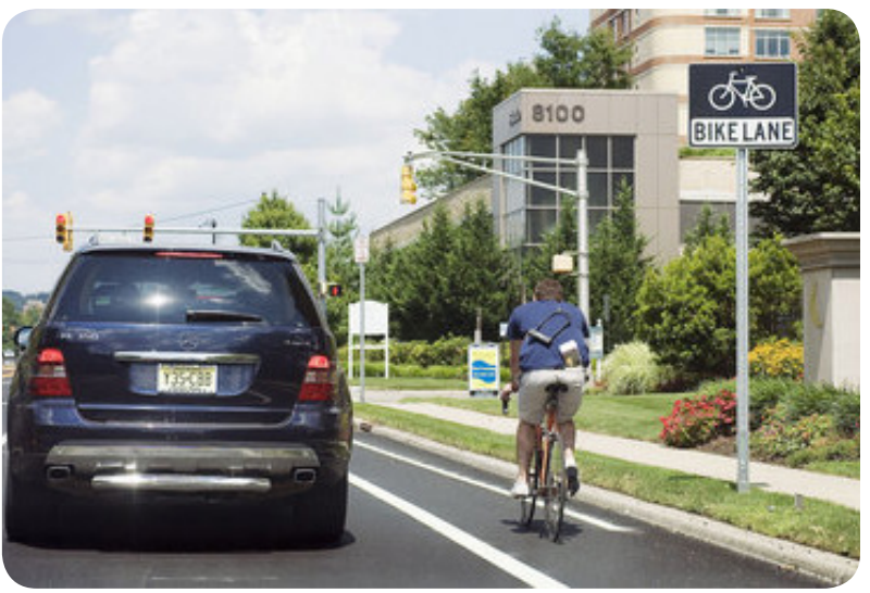
Narrowing the travel lanes on River Road in Hudson County, NJ allowed room for bike lanes.

Costs: Varies depending on method of narrowing the roadway.