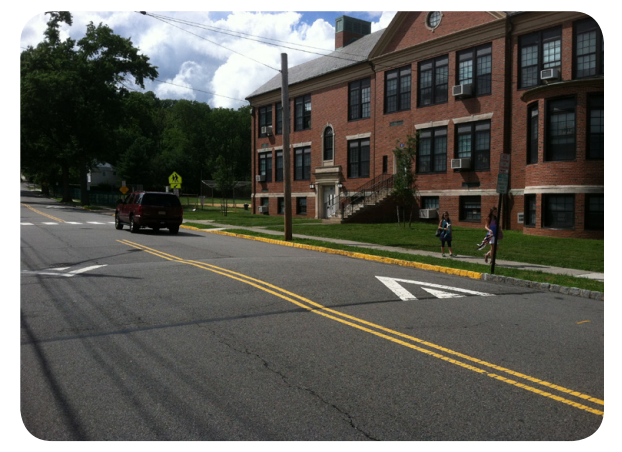
Speed hump in front of an elementary school in West Orange, NJ.

Costs: Varies depending on material ($1,000 - $12,000 each)