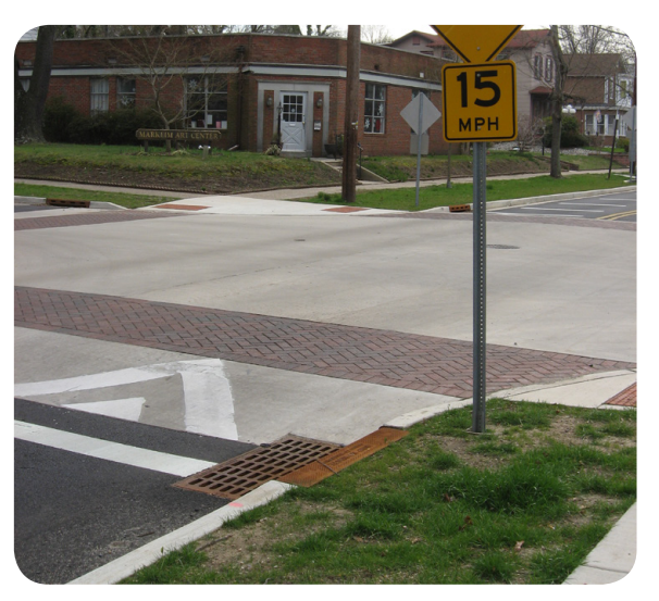
Raised intersection, Haddonfield, NJ.