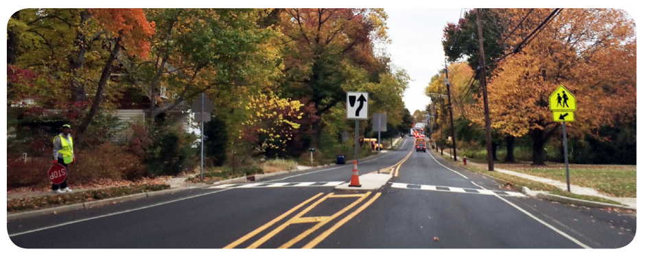
Pedestrian refuge in Lawrence Township, NJ.

There are several communities in New Jersey that have developed traffic calming programs or implemented traffic calming measures. These include: Hoboken, Maplewood, Fair Lawn, Woodbury, Haddonfield, Camden, Montclair, and Lawrence Township.