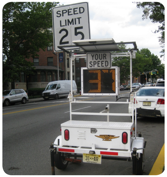
Temporary speed feedback trailer in Jersey City, NJ.