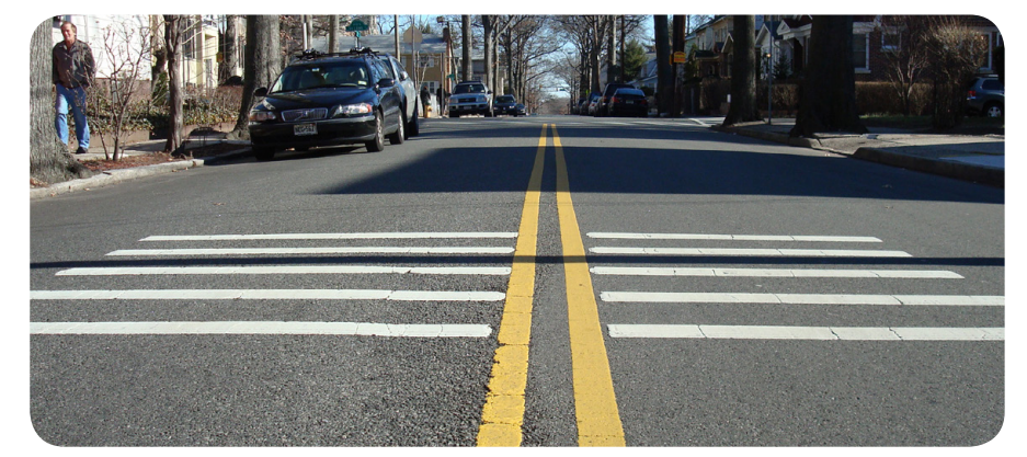
Rumble strips in Newark, NJ.

Drawbacks: Rumble strips are effective only through the noise and vibration they create. This same noise and vibration are their biggest detraction, particularly in residential areas. Drivers can more easily ignore rumble strips than other calming methods that vertically or horizontally deflect vehicles. Without adequate signage, rumble strips could startle motorists, potentially creating a hazardous condition. They also require increased maintenance; particularly during roadway re-paving. Costs: $7 - $10/foot