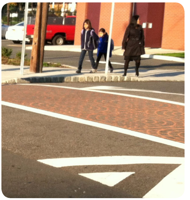
Textured crosswalk in Montclair, NJ.

Costs: Low to Moderate. Costs vary depending on materials used and size of paving area.