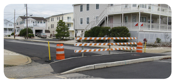
This permanent roadway closure in Ocean City, NJ preserves bicycle and pedestrian access.