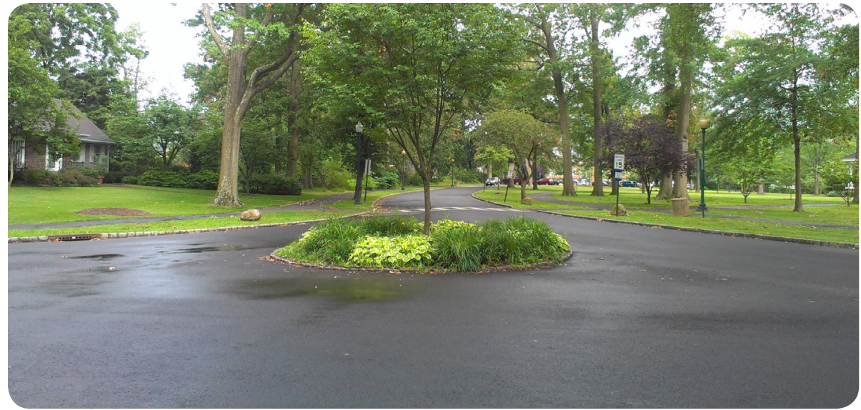
Mini traffic circle in Westfield, NJ.