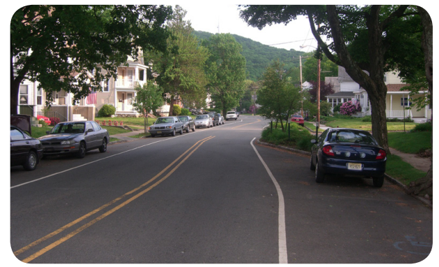
Roadway with a chicane.

Costs: $10,000 - $30,000 (paint versus physical diverter)