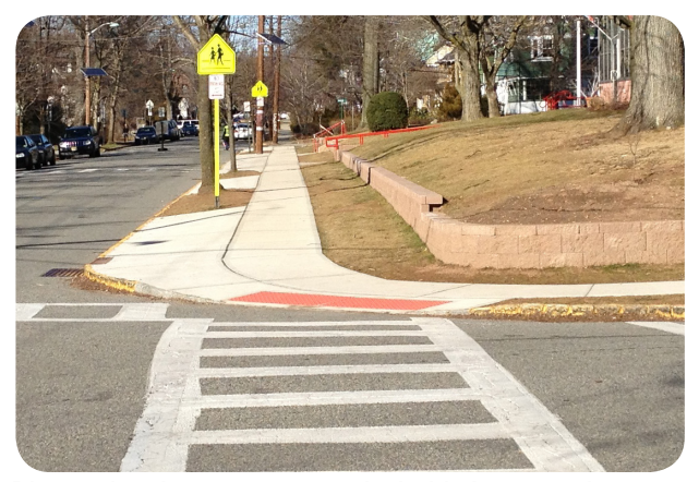
Diagonal curb ramps are not desirable because they force pedestrians into the intersection and are more difficult for visually-impaired people to determine the correct crossing location and travel direction. Image: Arterial