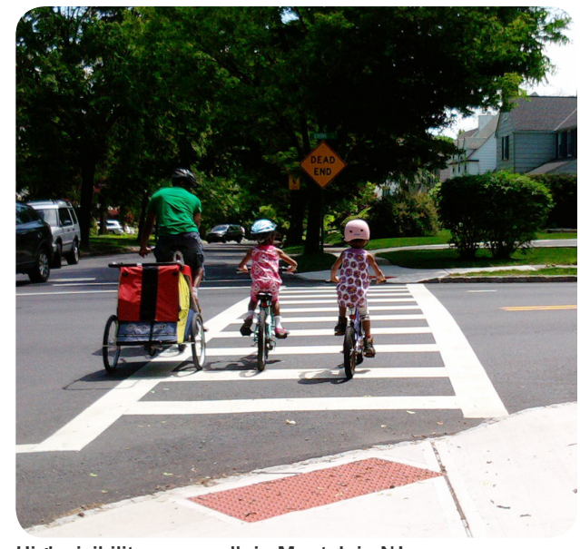
High-visibility crosswalk in Montclair, NJ.

school year. If necessary, fresh paint, inlay tape or thermoplastic should be applied and other improvements made to keep the crosswalks in good condition. Although initially more costly than paint, both inlay tape and thermoplastic are more costeffective in the long run. Inlay tape is recommended for new and resurfaced pavement, while thermoplastic may be a better option on rougher pavement surfaces. Both inlay tape and thermoplastic are more visible and less slippery than paint when wet.