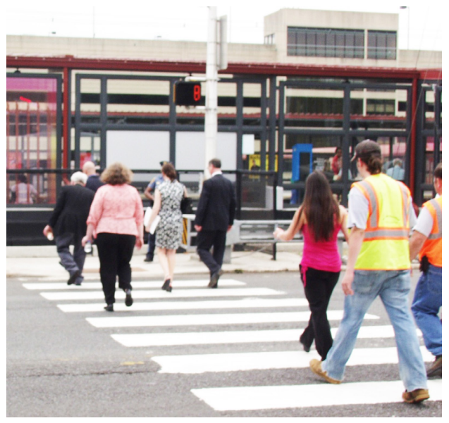
Pedestrians utilizing the HAWK signal to get to the Metropark Train Station.