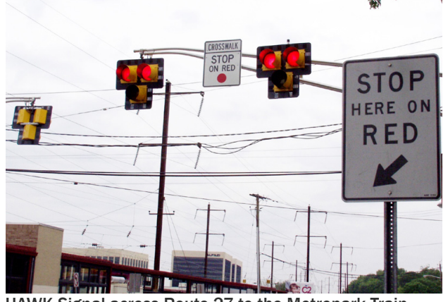
HAWK Signal across Route 27 to the Metropark Train Station.

Since the pedestrian hybrid beacon is a traffic control device many people are not yet familiar with, effort should be made to perform outreach to the public before implementation so there is no confusion about how the beacon operates and what drivers and pedestrians should do when encountering it.