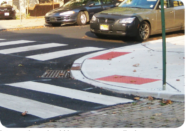
Intersections should have two perpendicular, ADA-compliant curb ramps per corner.

Curb ramps and crosswalks should be clear of obstacles. Existing conflicting elements should be moved as opportunities and budgets allow. No new poles, utilities or other impediments should be placed in the curb ramp return areas. When a corner is retrofitted with new curb ramps, the crosswalk markings may have to be moved so that the curb ramp fully aligns within the crosswalk.