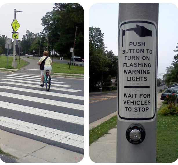
An RRFB signal has been installed in Atlantic County at the intersection of Old Tilton Road (NJ 687) and the Linwood Bikepath.