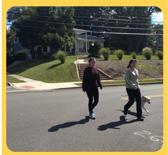
Pedestrians crossing at an unmarked crosswalk.

Crosswalks exist at all legs of all intersections but not every crosswalk is marked with painted lines. In fact, most are unmarked. In New Jersey, the driver of a vehicle must stop and stay stopped for a pedestrian crossing the roadway within any marked crosswalk, and they shall yield the rightof-way to a pedestrian crossing the roadway within an unmarked crosswalk at an intersection (N.J.S.A 39:4-36(a)).