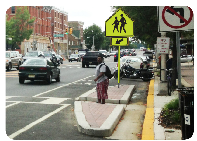
A mid-block storm-water curb extension example, Route 45 in Woodbury, NJ.

A curb extension also can slow turning vehicles and prevent drivers from parking on or near a crosswalk. Curb extensions must be designed to accommodate drainage. There are cases where curb extensions may not be needed or desirable on every leg of an intersection, such as when the street is narrow, parking is not permitted, or the curb would interfere with a bicycle lane or the ability of fire trucks or other large vehicles to negotiate a turn (AASHTO, 2009).