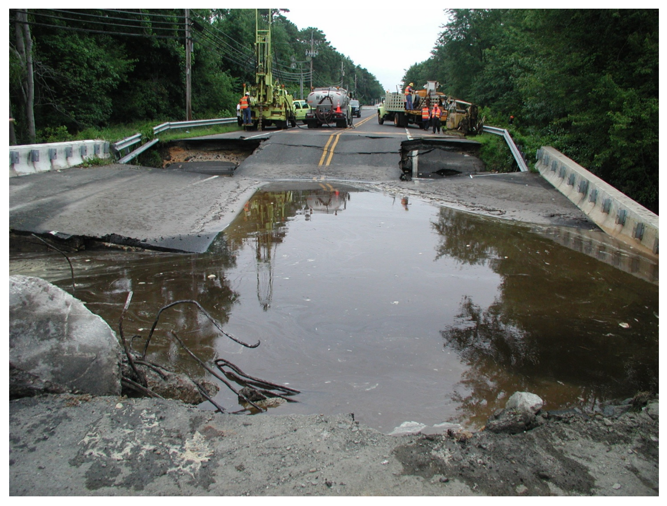
Bridge Collapse – Emergency Work