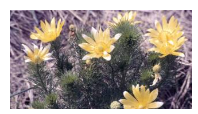
Species, Biotopes, Biodiversity