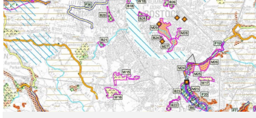
Landscape Master Plan (Region)