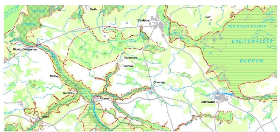
Landscape Program (Federal state)