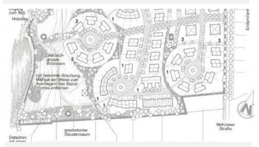
Open Space Plan (Sub-local)

Chair of Landscape Planning and Development