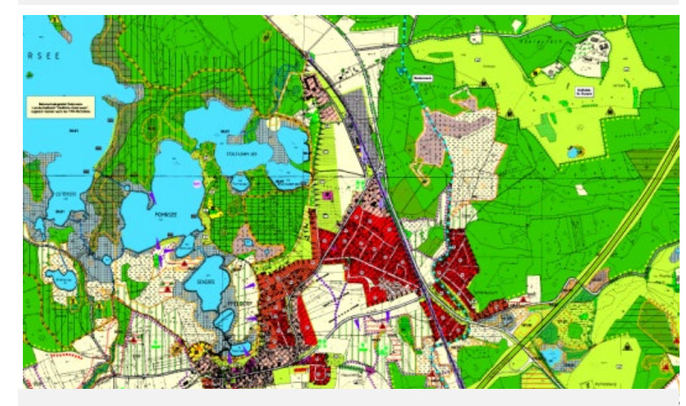
Local Landscape Plan (Municipality)