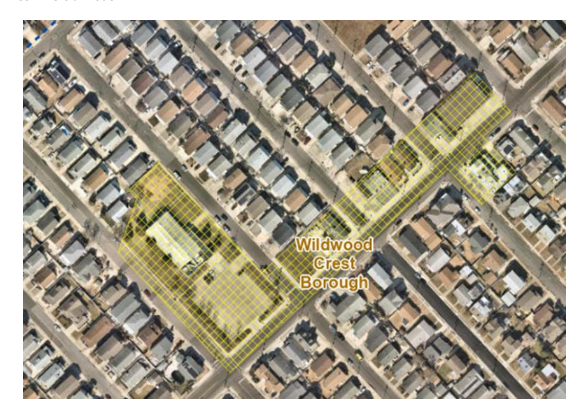
Showing detail of Bike pat and Crest Pier location