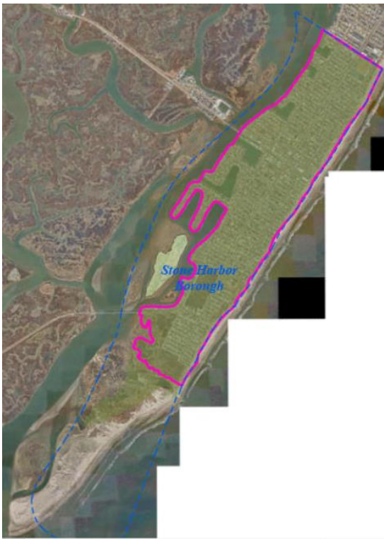
Previous (now expired) Center in Pink; 2023 proposed Center in orange. Municipal boundary in blue and the lighter green is for PA4b, Environmentally Sensitive Barrier Island Planning Area and the darker green is PA8, dedicated Open Space.

As with most barrier island communities, there are many residences and businesses built within the Special Flood Hazard Areas in Stone Harbor. To be consistent with the Executive Order 89 and Floodplain Management Rules, OPA is working with DEP and communities to limit residential flood risk exposure by discouraging incentivizing residential growth in floodplains while supporting resilient downtowns with mixed use, walkable communities – this essentially means smaller centers in flood-prone barrier islands. Since a major practical benefit of a center is that it allows a higher impervious coverage when obtaining a CAFRA permit, and existing impervious coverage is grandfathered, a built out community like Stone Harbor should not be negatively impacted by a smaller center concentrated in its business district. The following are Stone Harbor’s previous and proposed maps with Planning Areas and Center boundary: