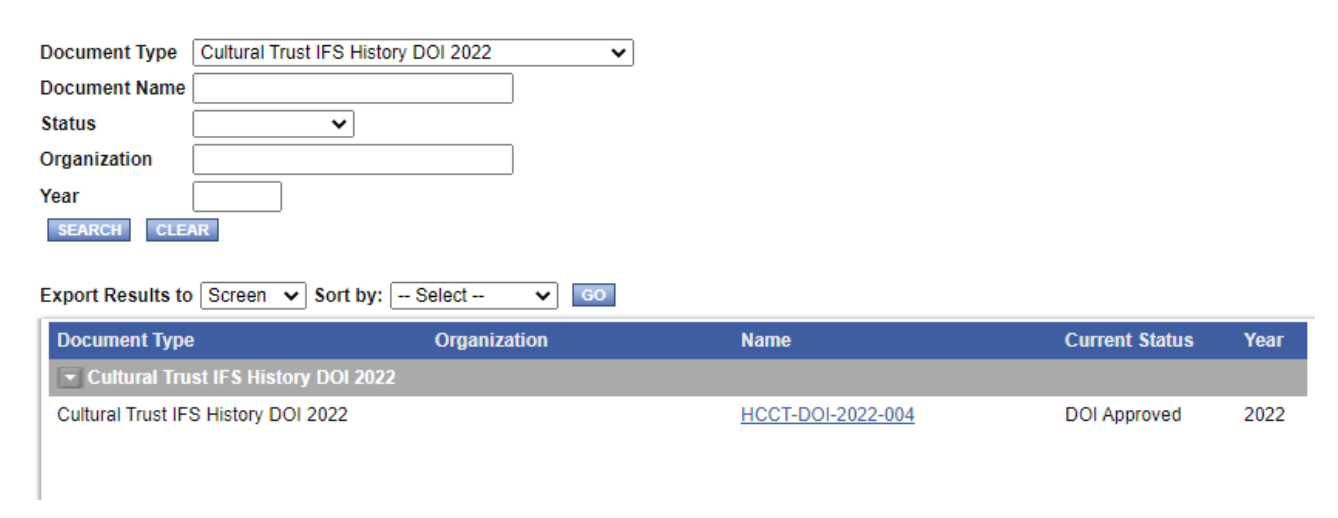
STEP 3 – Initiate the FY 2020 Cultural Trust application (<u>Initiate a/an CulturalTrust IFS History 2022</u>) by scrolling over the Related Documents and Messagestab: