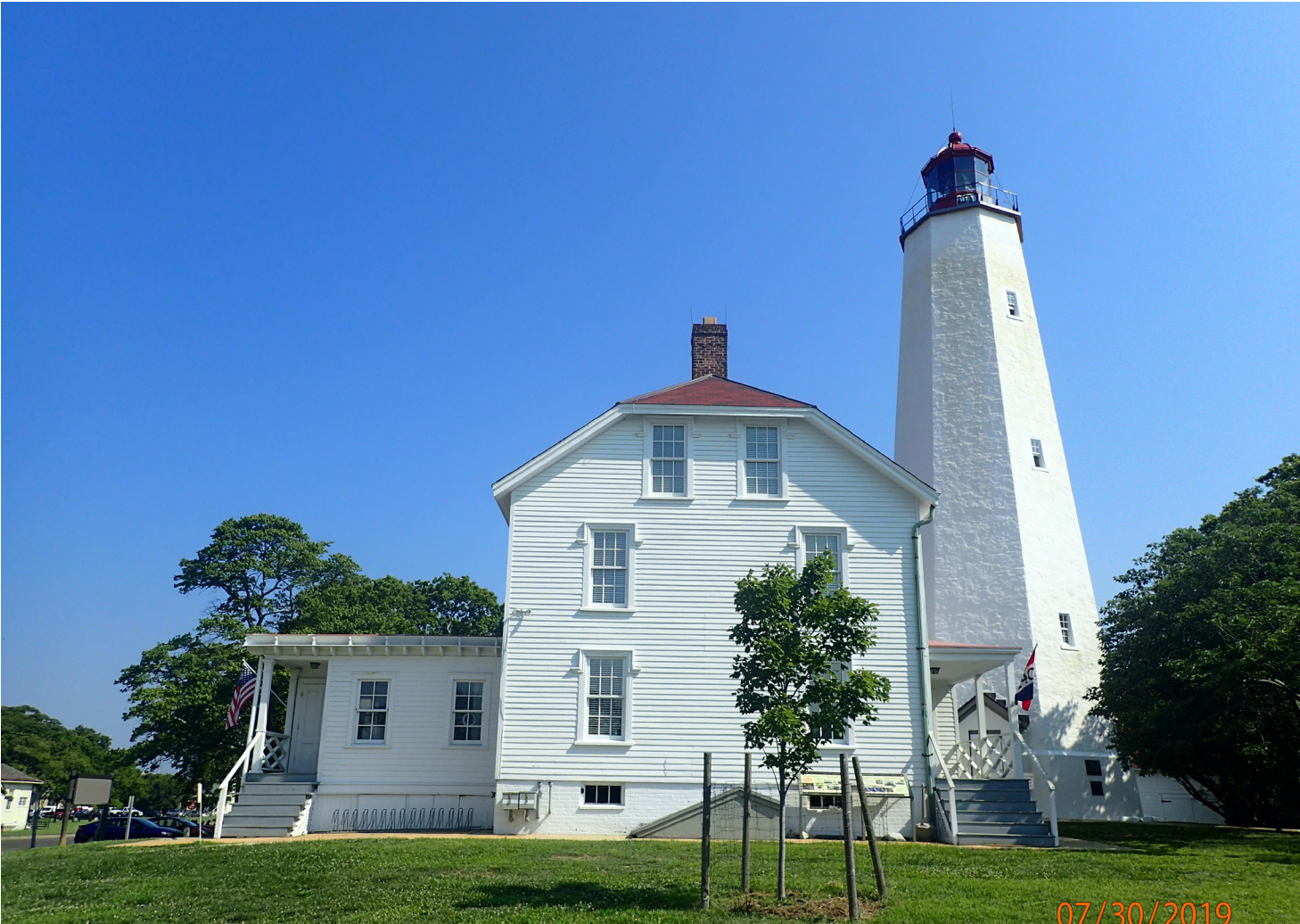
Sandy Hook Lighthouse, Gateway National Recreation Area, Highlands, Monmouth County