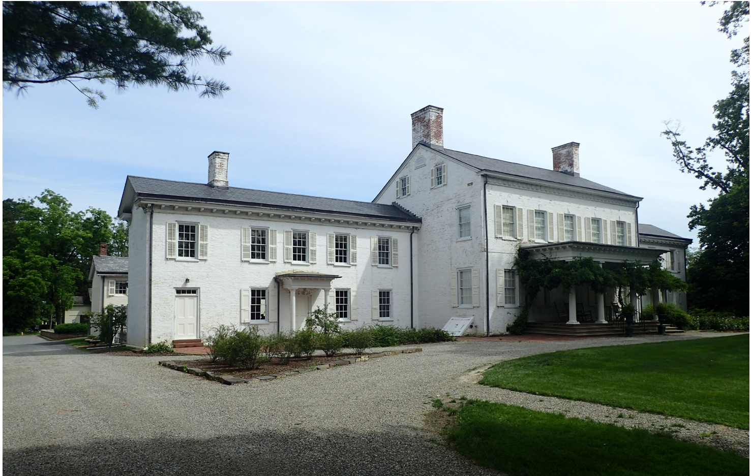
Morven Museum and Garden, Princeton, Mercer County