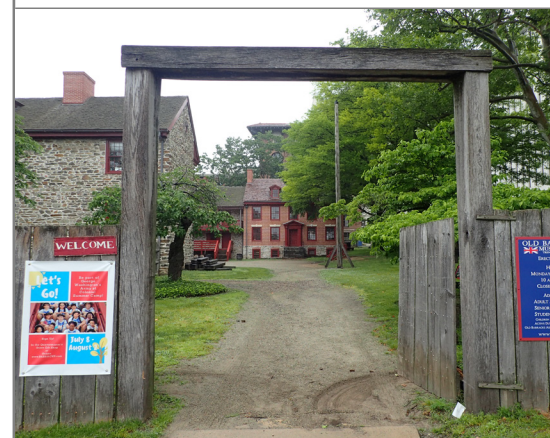
Old Barracks Museum, Trenton, Mercer County