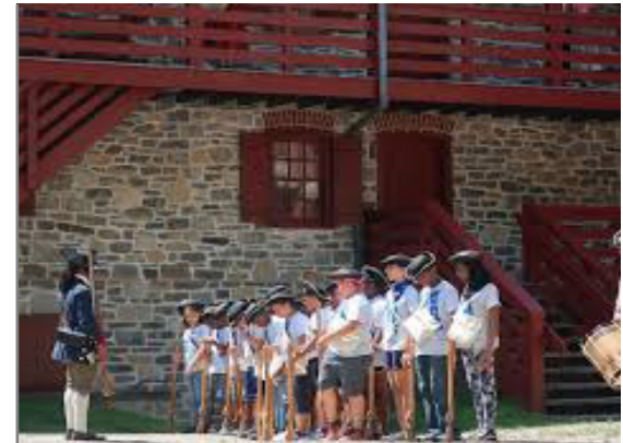
Students visiting the Old Barracks Museum, Trenton, Mercer County