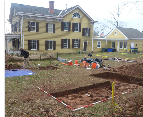
Archaeology at the Metlar-Bodine House Museum, Piscataway, Middlesex County

Site assessments determined that only 24% of the 150 Revolutionary War historic sites surveyed are