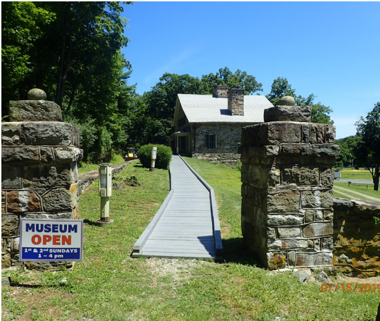
Shippen Manor/Oxford Furnace, Oxford Township, Warren County

degree or another. 69% of the sites had Priority A work; all 150 sites had at least some Priority B site improvement requirements identified. The total cost of physical improvements needed for the sites for Priority A is in excess of $250 million, and more than $125 million for Priority B. The results of this survey indicate that New Jersey needs significant investment in its historic sites if it is going to be ready for visitors in time for the 250th Anniversary.