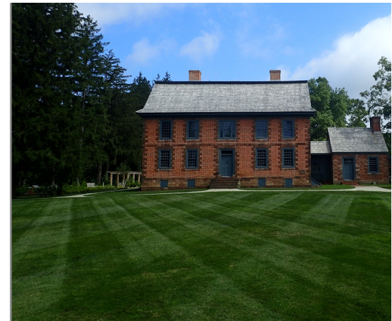
Dey Mansion, Wayne, Passaic County