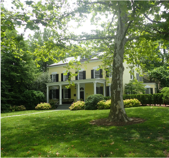
Maclean House, Princeton, Mercer County

and tourism marketing firm based in Georgia; and Hunter Research, a cultural resources consulting firm also based in Trenton, was selected to work with the Crossroads of the American Revolution Association and their state partner, the New Jersey Historical Commission, to visit and assess the 150 identified sites in terms of site and visitor readiness. This assessment is intended to be a broad, first look, a snapshot if you will, of the physical condition of each site; how the site is interpreted, particularly in relation to the American Revolution; and how visitors are welcomed and engaged. This extensive trove of information has been analyzed to provide preliminary cost information for how much the state, counties, local governments and private partners will need to invest to fully take advantage of the opportunity that the 250th Anniversary represents. In addition to physical improvements, this funding will help identify particularly compelling themes and stories that will attract new visitors to the state, as well as the best ways to provide a key entry to introduce visitors to the American Revolution in New Jersey.