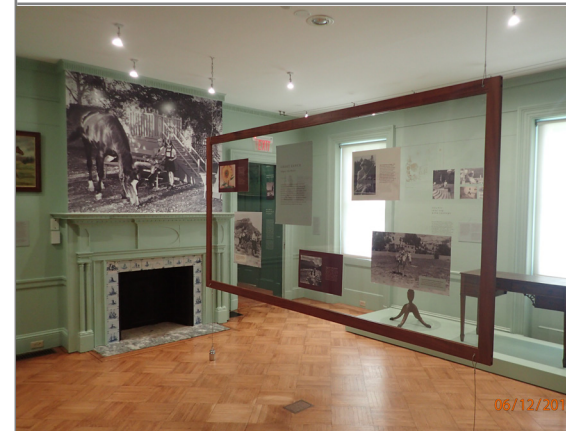
Morven Museum and Gardens, Princeton, Mercer County