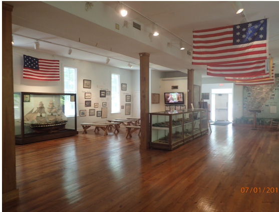
Historic Cold Spring Village, Cape May County

addition, the costs described in this report should be prioritized, and future studies and plans completed to further develop strategies for making the most effective investments, and for completing the work in time for 2026.