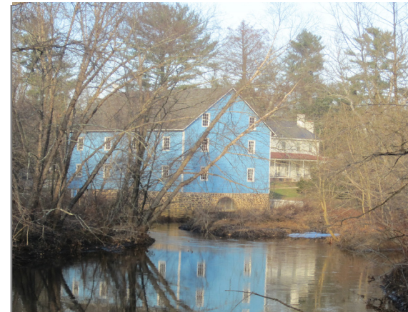
Historic Walnford, Monmouth County

The costs identified as part of this report are, by necessity, conceptual in nature. This Assessment is intended to be a broad look at all of these sites, giving an unbiased sense of their condition at a particular moment, and providing an "order of magnitude" estimate of the investment required to make them visitor ready. The total costs relating to site and facility improvements, site interpretation improvements, marketing, staff and volunteer training, and the construction of a new Visitor Experience Center in Trenton, approaches $500 million. This clearly represents a large investment, which should be further vetted and prioritized. All levels of government (federal, state, county and local) will need to be involved, and private partners (foundation, individual and corporate) identified. In