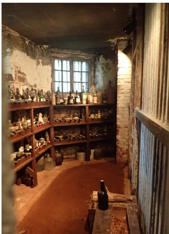
Liberty Hall Museum, Union, Union County