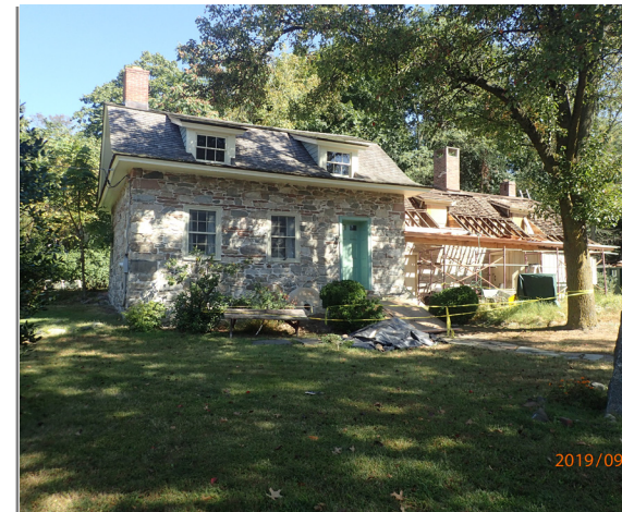
Van Allen House, Oakland, Bergen County

As might be expected, the 150 sites are in a wide range of conditions, from boarded up with no visiting hours, to excellent condition with clear and well-organized hours and tours. In terms of the physical character of the sites (site and landscape, building exterior, building interior), the conditions run the full gamut, from “5” (good) to “1” (unsatisfactory). Items requiring repair and improvement were also ranked in terms of priority of need, from “A” (immediate) to “C” (long-term). The majority of the items identified were in the “A” (immediate) category. All of the sites need work to some