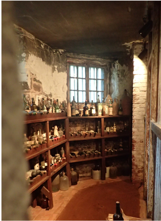
Liberty Hall Museum, Union, Union County

enslaved, native and foreign-born, all experienced the chaos in real and tangible ways. Those left at home struggled to maintain farms, businesses and the framework of government; children likely learned less from books and more from the day to day struggle for survival; social linkages dwindled as communication and movement around the countryside and towns were constrained by military activity.