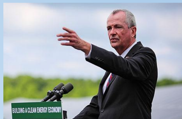
Governor Phil Murphy

On January 27, 2020, Governor Phil Murphy revealed New Jersey's Energy Master Plan (EMP) that established guidelines for the state to achieve the goal of 100% clean energy by 2050[1]. The EMP is one of the most aggressive plans in the nation with regards to responding to the threat of climate change and reducing carbon emissions. The recommendations in the EMP were selected based on findings from the New Jersey Department of Environmental Protection (NJDEP) and comprehensive climate change reports authored by Rutgers University. The consequences of climate change include rising sea levels that pose a threat to coastal communities and health issues such as increased rates of asthma.