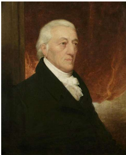
Col. Henry Rutgers