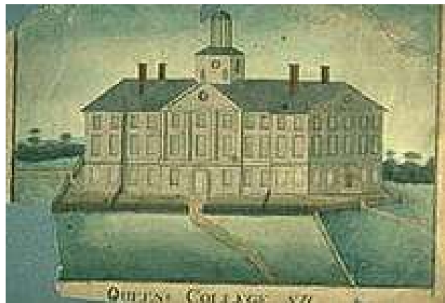
Queen's College, today Old Queens, was constructed from 1809 to 1825.

Legislature of New Jersey authorized the new name Rutgers College. Col. Rutgers the next year in 1826 made a gift of $200 to purchase a bell for the new college building which remains in the cupola of Old Queens at Rutgers – New Brunswick's College Avenue campus today and dedicated the interest on a $5,000 bond to Rutgers College.