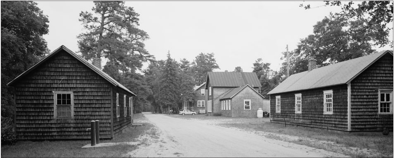
The Whitesbog Village and Cranberry Bog site includes multiple buildings within the context of a historic landscape.