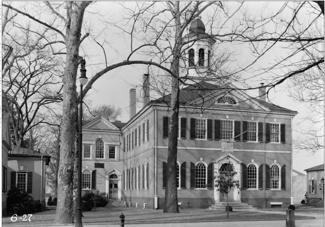
A detailed assessment of the Burlington County Courthouse resulted in its restoration and continued reuse.