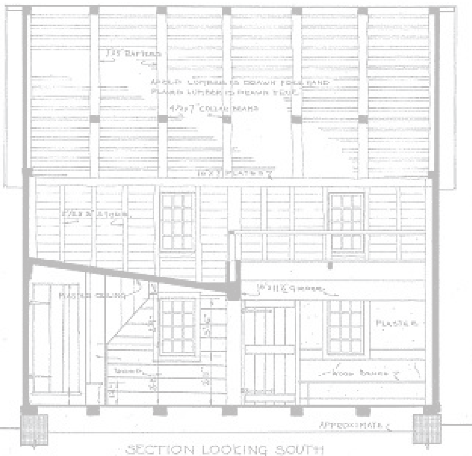
Measured drawings, such as these building sections of the Friends Meetinghouse of Randolph, can be a helpful tool to clarify existing conditions and note areas of deterioration. HABS NJ-145. Henry W. Vreeland, Delineator, 1935.