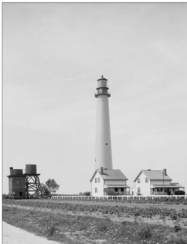
LC-DIG-det-4a19499. Detroit Publishing Co. no. 039194, c. 1900.

When completing a significant intervention or construction project, it is also prudent to ensure contractors minimize risk associated with the work including limiting or restricting welding operations, limiting or prohibiting flammable or toxic materials, providing adequate security, and requiring the prompt removal of construction debris and rubbish.