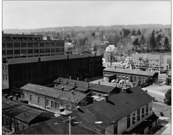
Sites with multiple buildings, such as the Thomas A. Edison Laboratories, Essex County, NJ, will be more expensive to document than sites with one building.