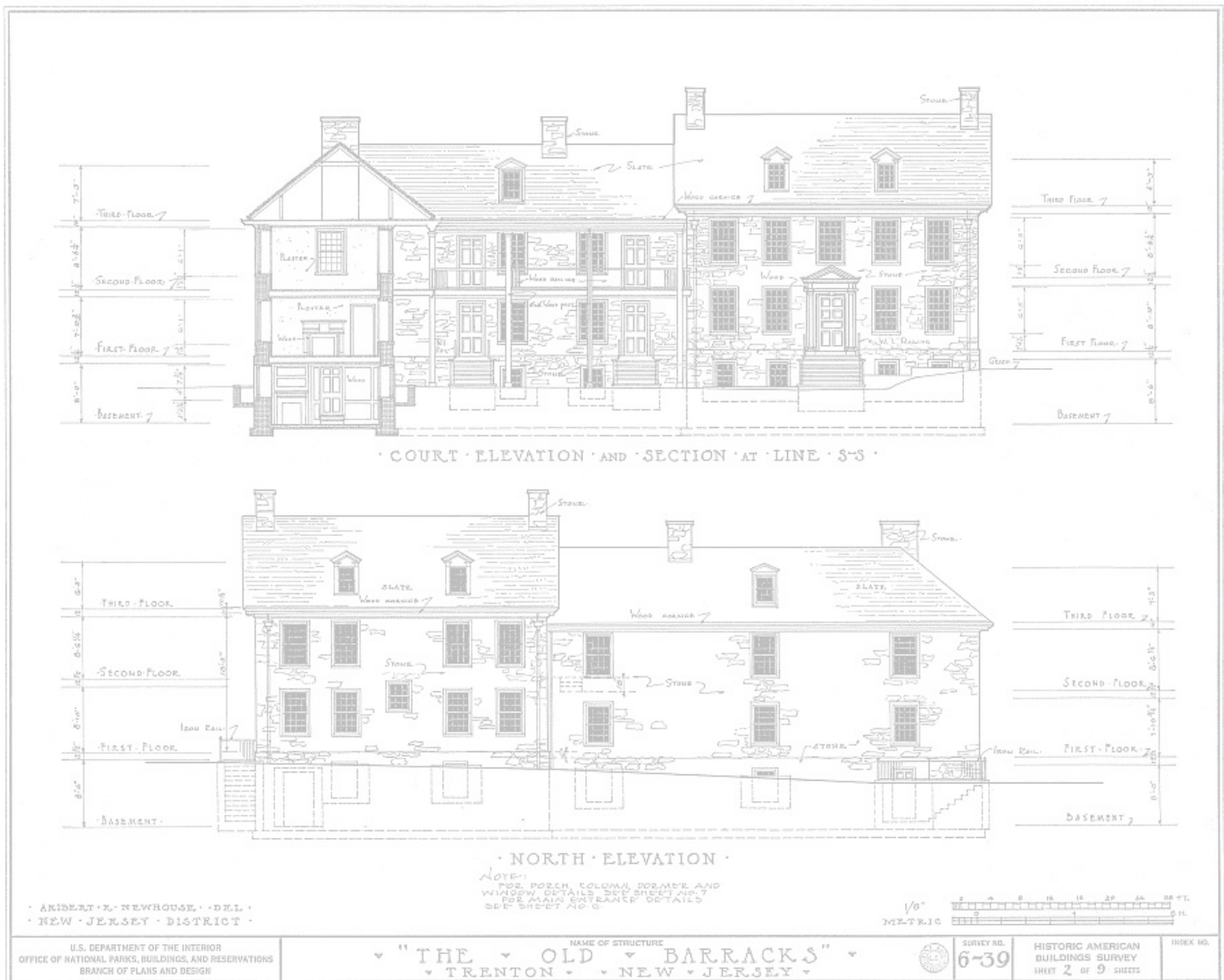
Measured drawings, such as this plan of the Old Barracks, can be a helpful tool to clarify existing conditions and note areas of deterioration. HABS NJ,11-TRE,4- (sheet 2 of 9) - Old Barracks, South Willow Street, Trenton, Mercer County, NJ.