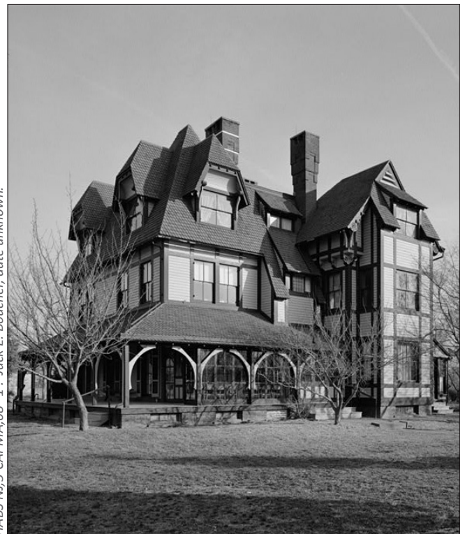
HABS NJ,5-CAPMA,68--1. Jack E. Boucher, date unknown.

Since they are typically prepared in anticipation of a specific project, the long-term benefit of a PP as a resource document is considerably less than a HSR. However, PPs can be supplemented and updated to reflect the depth of information found in a HSR.