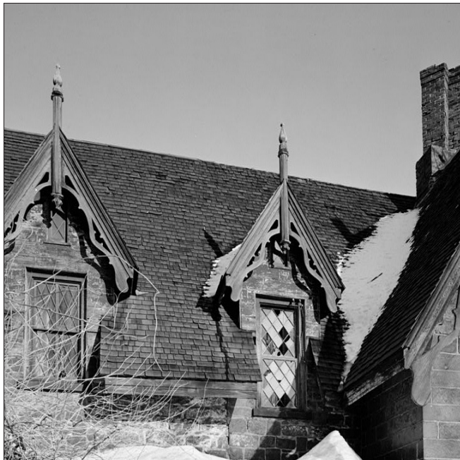
HABS NJ,2-HOHO,1-. Jack E. Boucher, 1971.

Regular maintenance, such as replacing broken glass as seen in the photograph from the Hermitage (Ho-Ho-Kus), can reduce vulnerabilities and hazards at a property.