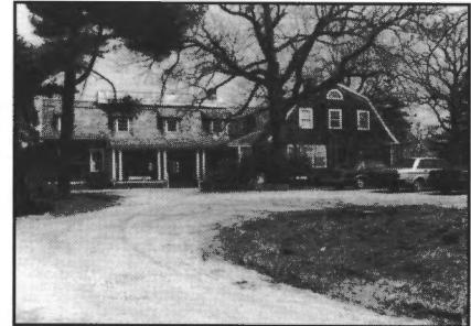
Water Witch Casino, Middletown

Some researchers are already beginning to use these records successfully. The Monmouth County Archives has the best and most complete overall collection of building contracts and mechanic liens of any county in New Jersey, and its staff has