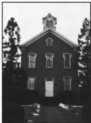
Church Street School, Essex County

Lien docket entries are important records, because for any specific building a researcher is more likely to find a lien claim than a contract. From lien claims one can find out who the contractors were, even if no contract was ever filed. In some cases, several lien claims were filed for the same building project, and sometimes they reveal business relationships among contractors, subcontractors, and suppliers. For example, when a project to build an opera house went awry in Asbury Park in 1887, subcontractors, suppliers, and workmen together filed twenty-five lien claims.