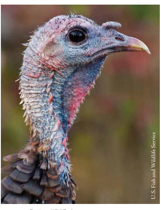
Eastern Wild Turkey

After the close of the Fall 2019 Turkey Season, physical turkey check stations will no longer be used. Beginning with the Spring 2020 Turkey Season, all hunters will be required to report a harvested turkey on the day killed using the Automated Harvest Report System.