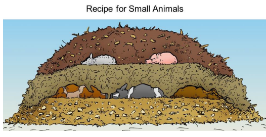
Cornell Waste Management Institute

Note: With the exception of wood chips, this material should not be used for the compost bed, but can be used to insulate and filter odor in the outer layers of the windrow or static pile.