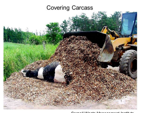
Cornell Waste Management Institute Cover carcass with dry, high-carbon co-composting material, like old silage, sawdust, or dry stall bedding (some semi-solid manure will expedite the process)