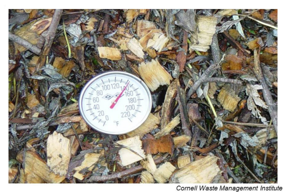
Temperature 110-160 F

"Thermophilic Stage" means a stage of composting when the compost heats up reaching 140°. Harmful bacteria die off and the pile starts to breakdown rapidly. The compost pile should be damp and sufficient air should reach the core of the pile. This stage can last up to 3 months depending on materials and the type of method employed.