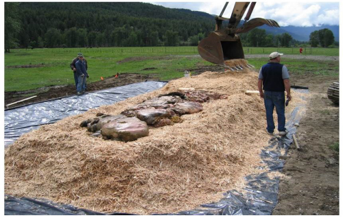
Cornell Waste Management Institute