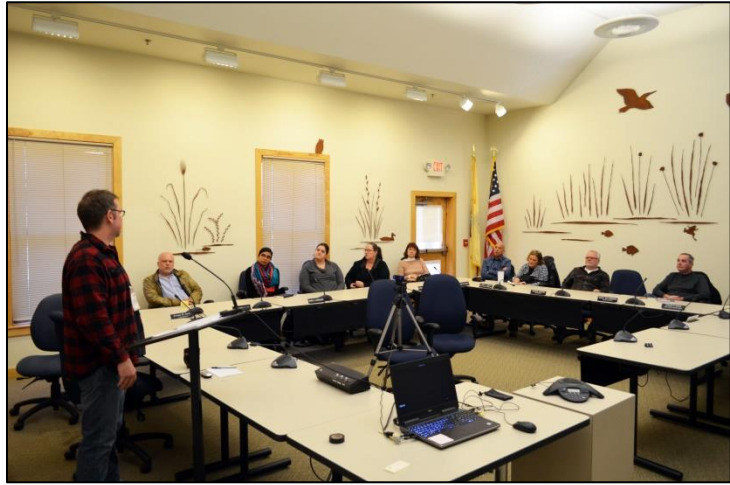
Above: In December, the Commission hosted a presentation that delved into the history of the Head of the River Cemetery in Estell Manor.