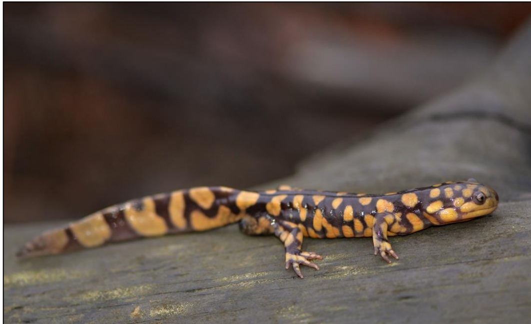
Above: A male tiger salamander found at a breeding site on December 14, 2019.