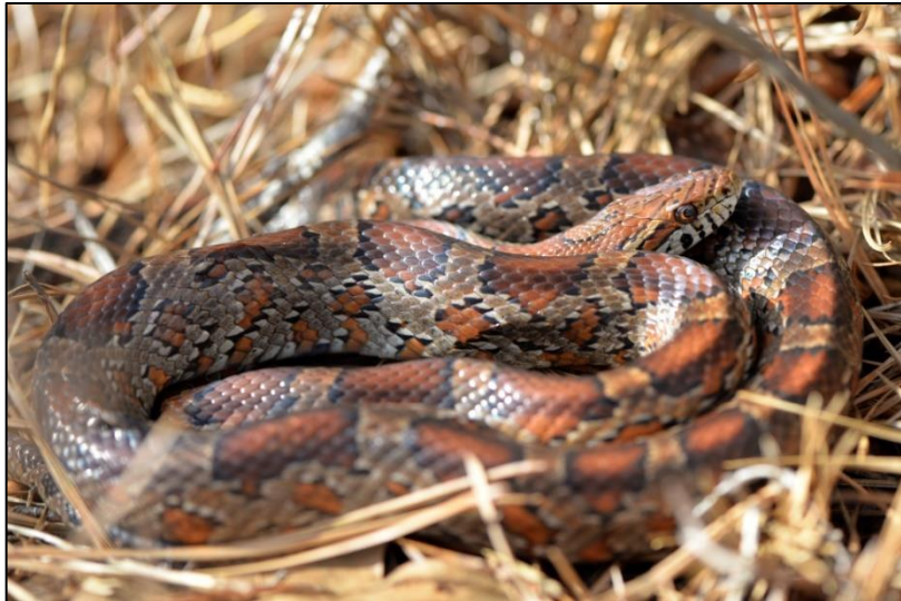
Above: A male corn snake basking near his den on December 26, 2019.