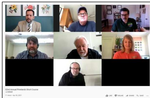
Above: Communications Office staff hosted and moderated the first-ever, virtual Pinelands Short Course with five panelists on Saturday, April 24 th .