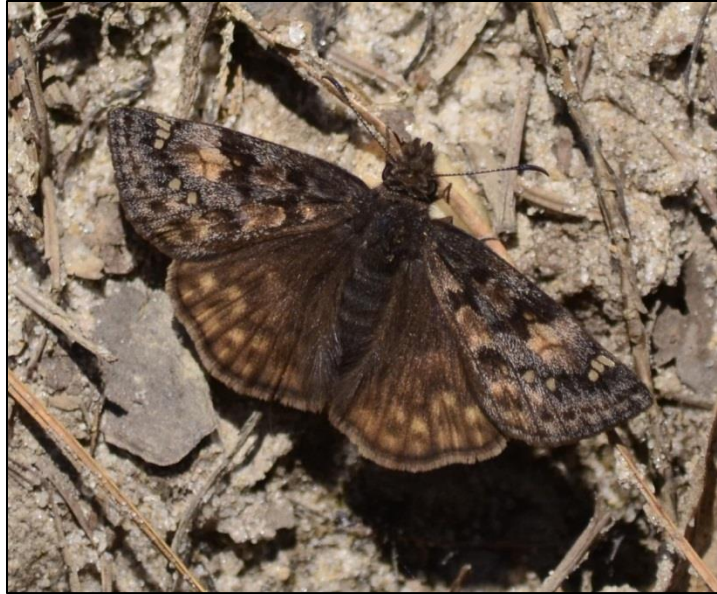
Above: The Communications Office shared six videos and 158 photos on the Commission's Instagram site in April 2021, including this photo of a Juvenal's duskywing butterfly in Wharton State Forest.