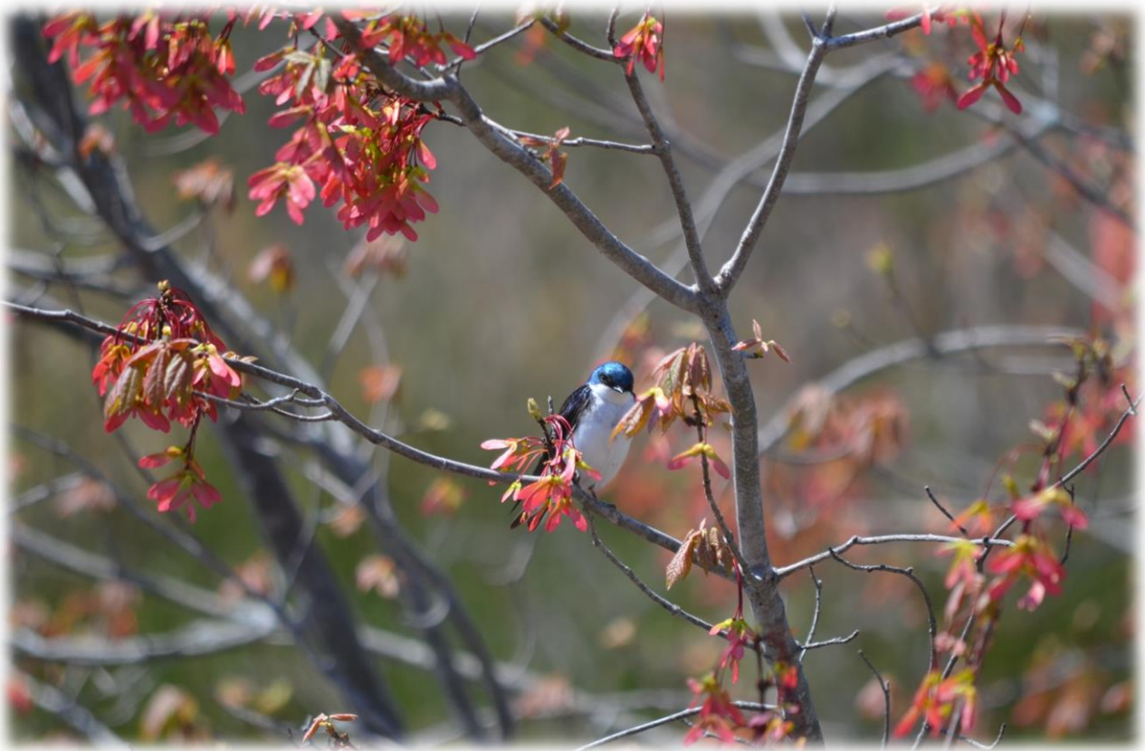
A tree swallow perched in a red maple tree at the Franklin Parker Preserve in April