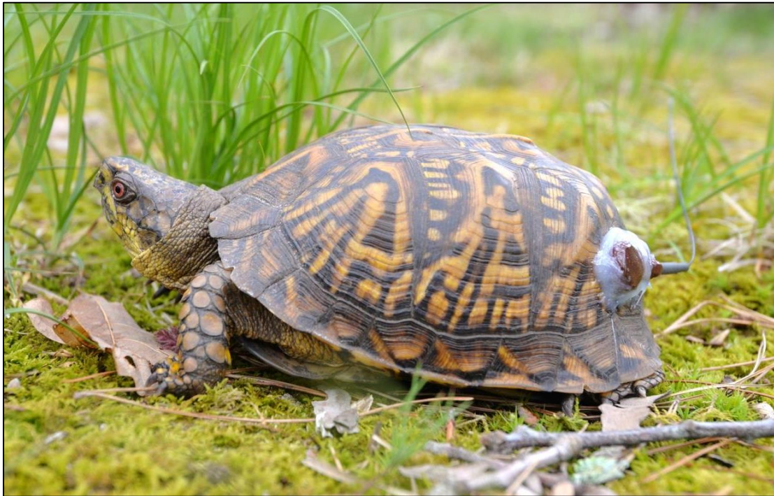
Above: An Eastern box turtle with a radio transmitter attached to its shell with epoxy