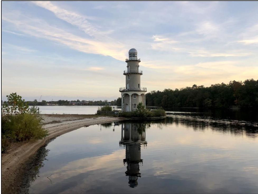
Above: Built in 1939, the lighthouse at Lake Lenape Park East in Mays Landing is an iconic landmark located on the Pine Barrens Byway.