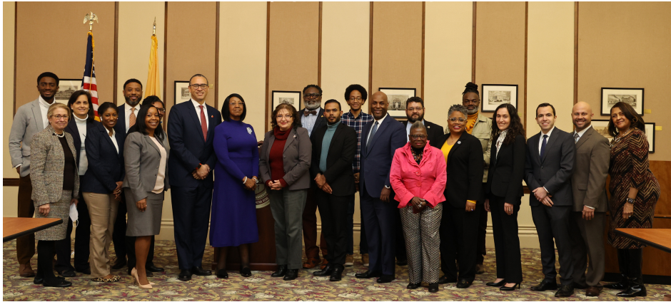
Spring 2022

Several budget initiatives were championed by the Wealth Disparity Task Force in a collective effort with legislative partners and advocates to advance the work that addresses the long-standing wealth disparities which disproportionately affect Black and Latino households. Here are some of the impactful initiatives: